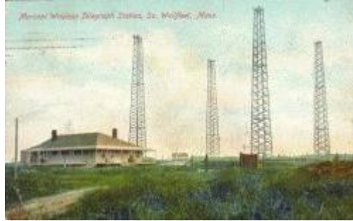
Figure 1- Marconi Wireless Telegraph Station, South Wellfleet, Mass.

Antenna systems, as mentioned above, are normally above the roof-line. They have been a part of American popular culture since the invention of radio.