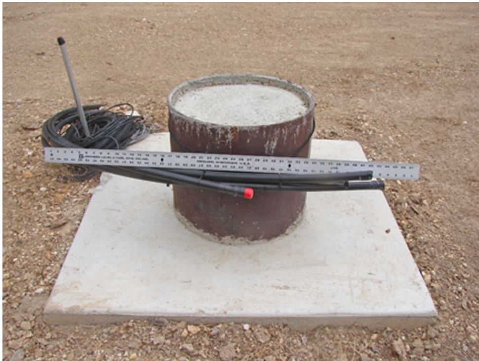
Exhibit F – Monopole Foundations Completed and Inspected