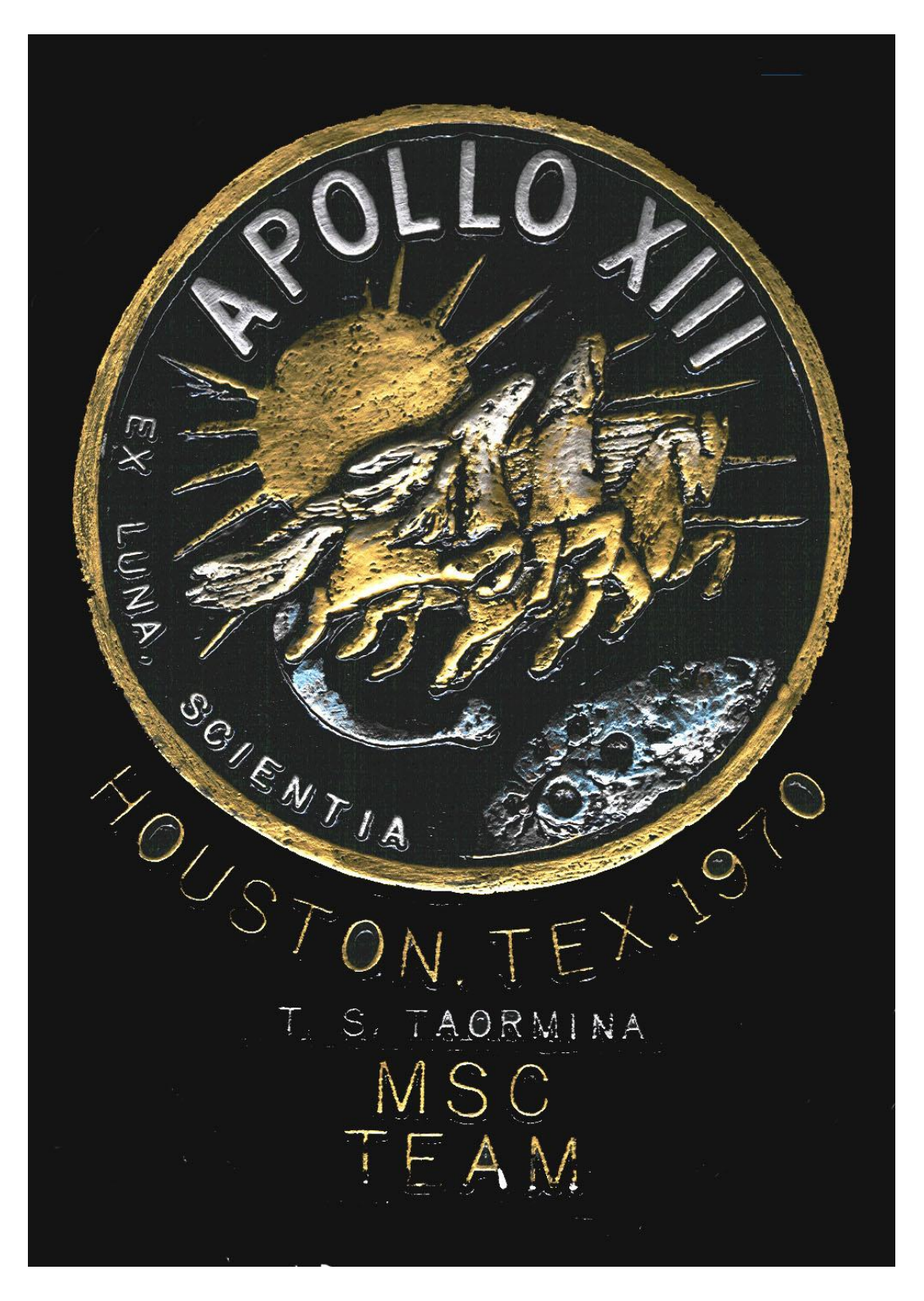
Plaques presented to members of the Mission Control Team during Project Apollo. MSC is Manned Spacecraft Center, which was the name until it was changed to Johnson Space Center