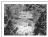
2008-09-09 - Ease... (286KB)