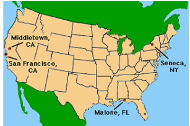
LORAN-C stations across the contiguous United States