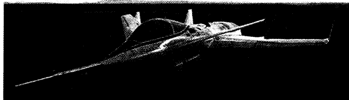
NASA's HiMAT remotely piloted vehicle after flight at Dryden Flight Research Center.

This emergence of computer flight simulation in the 1970s appears to have sparked a monumental amount of research. The U.S. Air Force began its Visually Coupled Airborne Systems Simulator (VCASS) program, with a particular eye toward future-generation fighter aircraft ("VCASS: An Approach to Visual Simulation," Kocian, D., 1977). NASA was developing synthetic vision for the Super Sonic Transport and for its High Maneuverability Aircraft